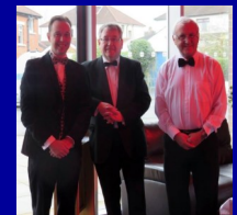
The Maître De and waiters

The contented faces of some of those who partook of the extensive 'fare' reflects a job well done. Over £650 was collected which will go to Church Funds and Open Schools World Wide. This charity provides schooling/ education for children who would not normally have access to full-time schooling. To date 3,000+ children world wide have been provided with an opportunity to start an education.